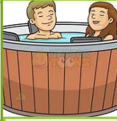
Wood fired hot tub