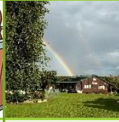
Club rooms with all facilities