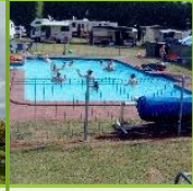
solar heated pool